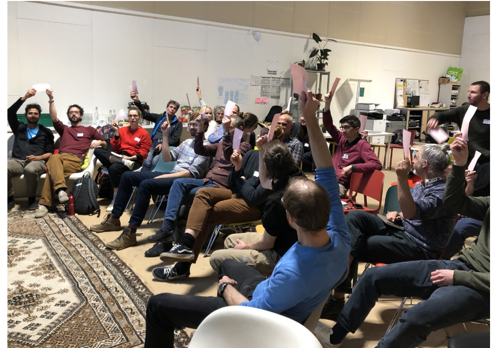
Voting at the members' assembly in Lausanne.