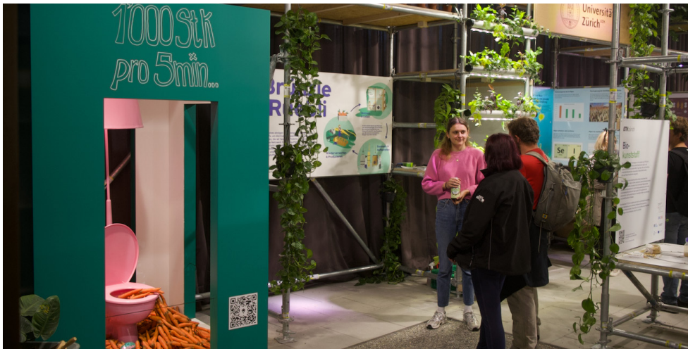
Flushlight at the Olma.