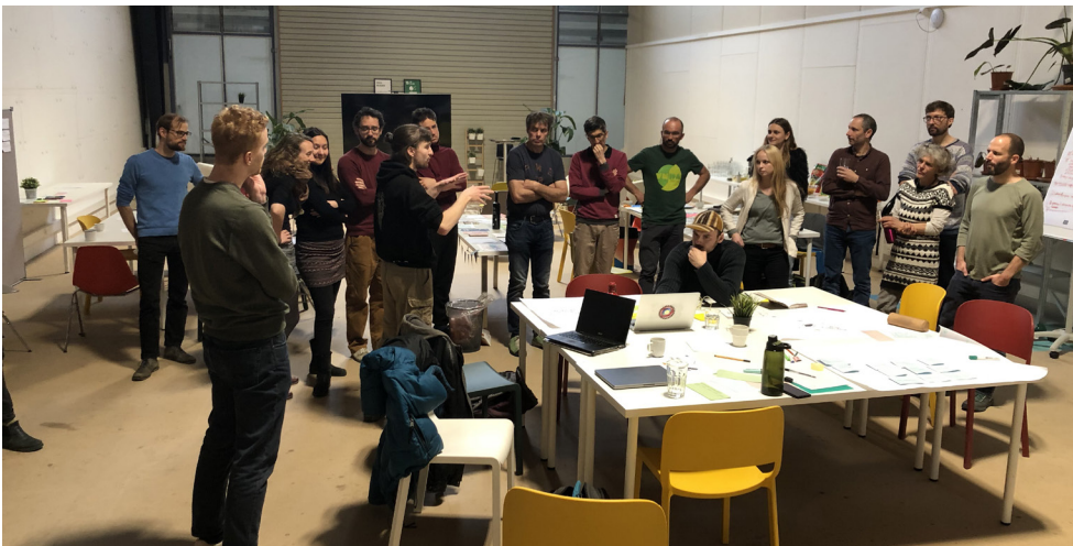
Our working groups meet on site for the members' assembly.