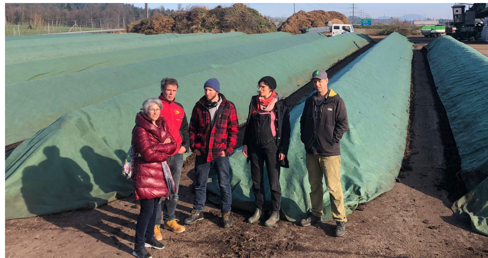
Collective visit to the pilot project in Uster.