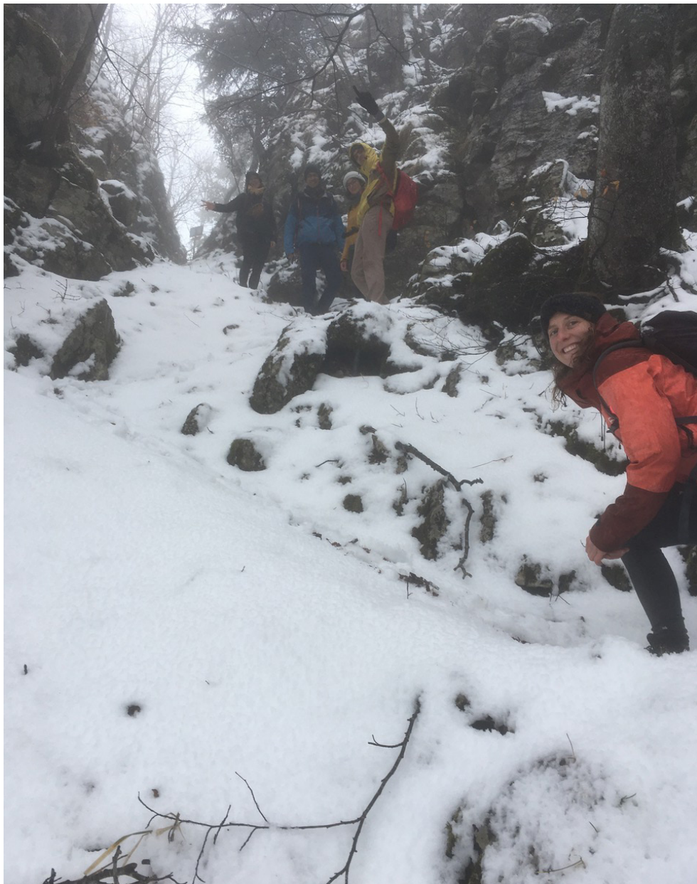
Snow and cold in Bern's Jura don't stop our Board of Directors.