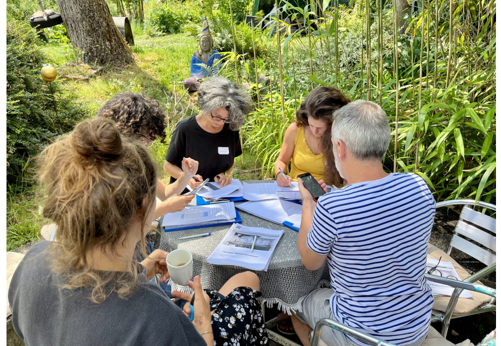
We work together in the KREIS house to close loops.