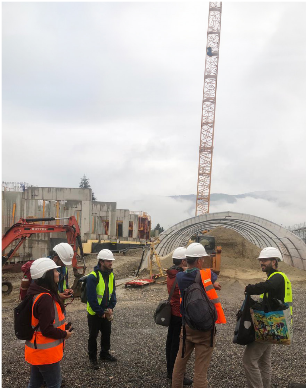
Visit to the construction site in Geneva.