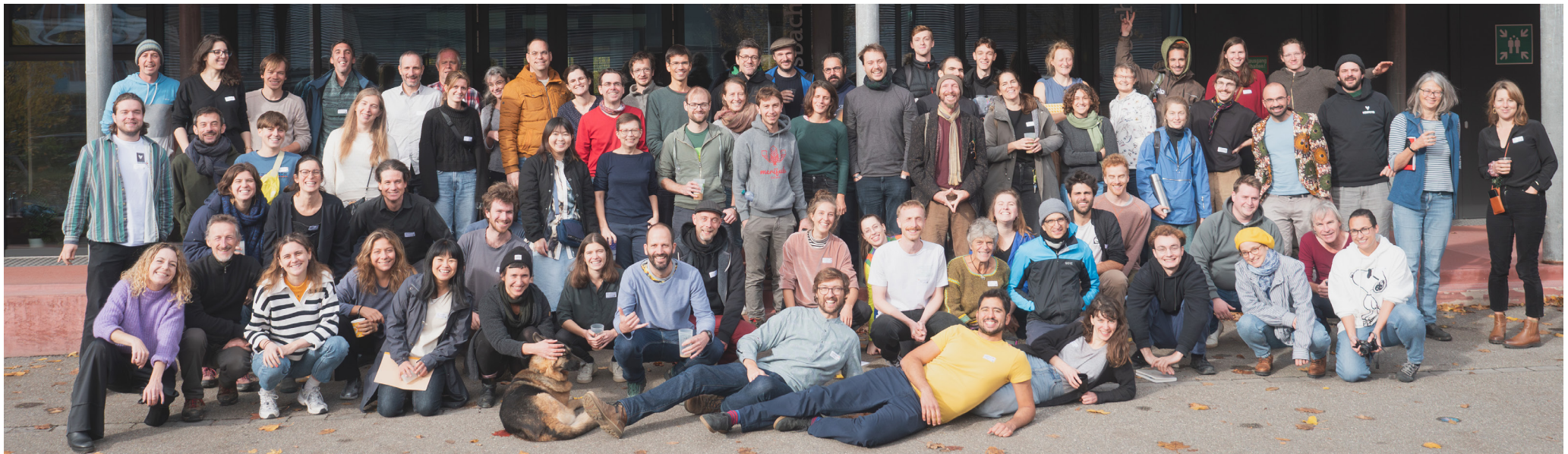
Almost one hundred participants came together at the international network meeting in November.