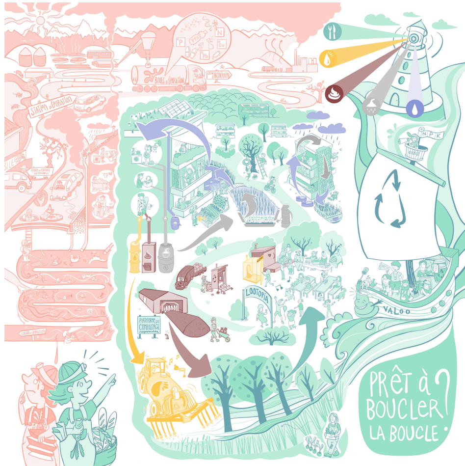
Fig.1 Illustration: Mitchell & Keppler textularia.com

VaLoo, the Network for Circular Sanitation in Switzerland, was founded on the 19th November 2021 on World Toilet Day. VaLoo brings together engaged actors collaborating to promote and facilitate the implementation of resource-oriented sanitation systems in Switzerland.