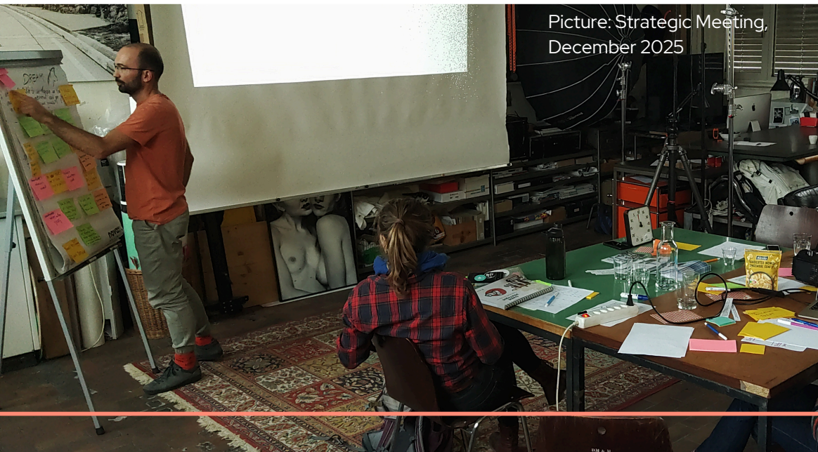
Picture: Strategic Meeting, December 2025