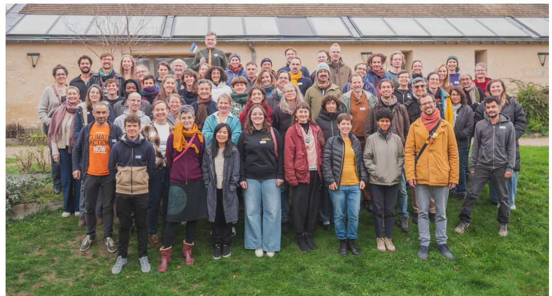
Photo: European Circular Sanitation Congress co-organized by VaLoo