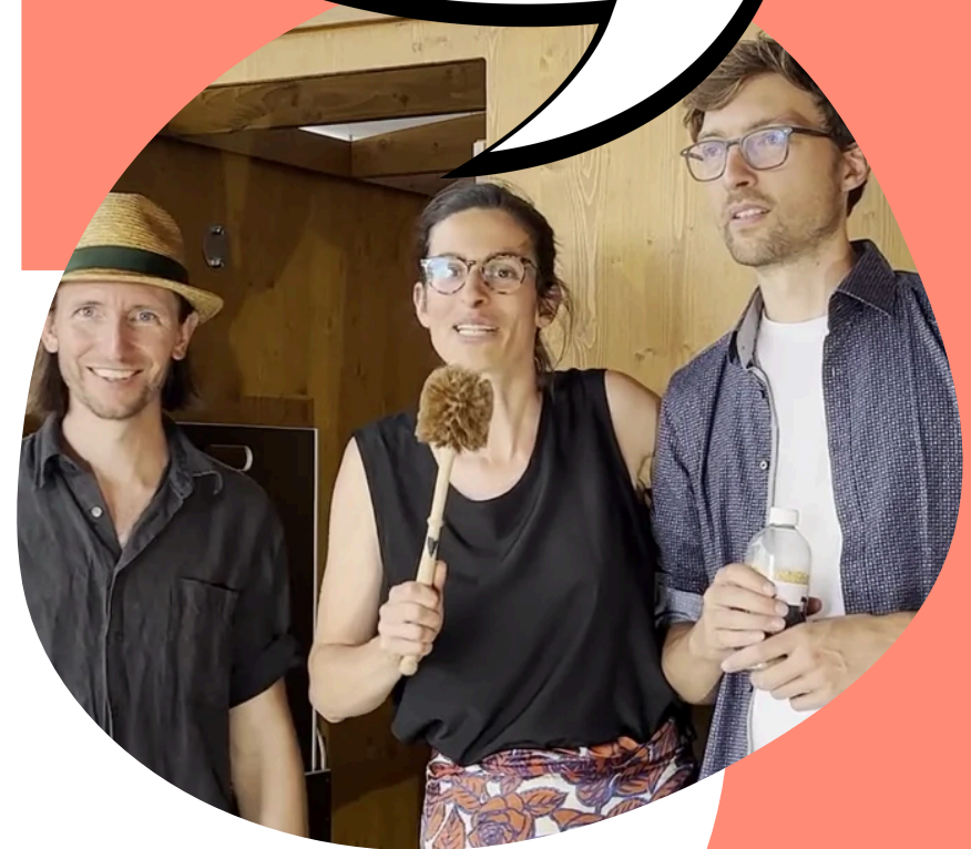
Picture: The Circular Toilet, ClimaNow 2025 Winner 2 nd place