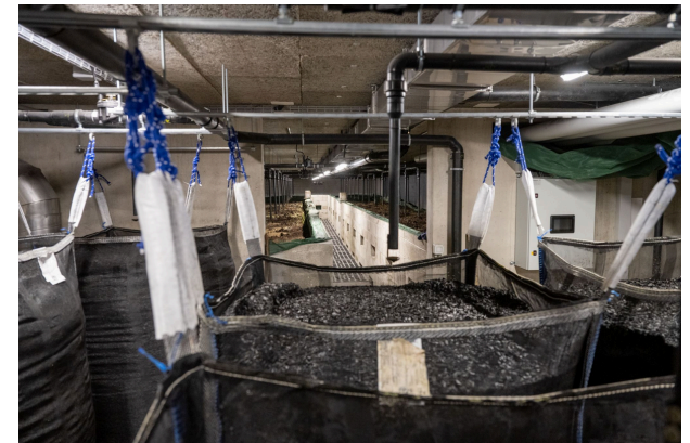
Photo: Circular sanitation installation, la Bistoquette

The ZHAW project “Greywater Reuse” addressed this challenge, demonstrating that decentralized greywater recycling is technically feasible but still insufficiently integrated into the Swiss regulatory framework. Widespread adoption will require clarifying legal ambiguities and fostering interdisciplinary collaboration among federal authorities, cantons, and industry stakeholders. The project’s recommendations can guide discussions and inform future regulatory frameworks.