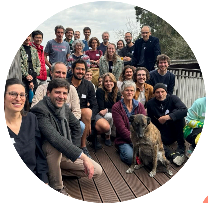
Picture: Member Assembly, 2025